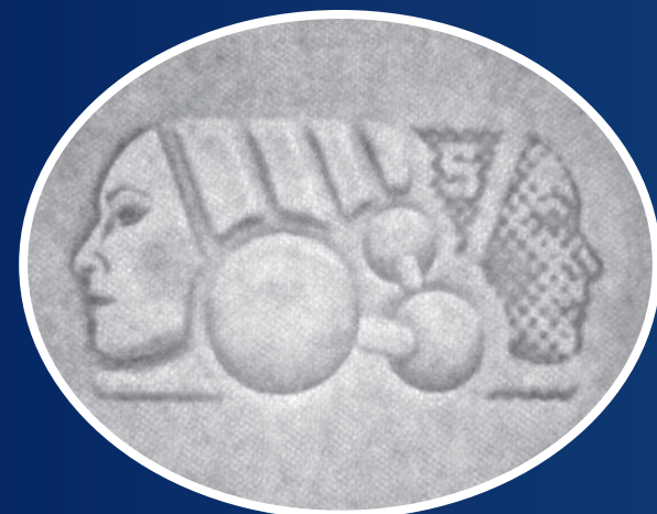
Easily integrated with multitonal watermark