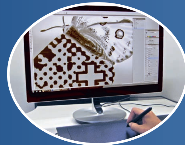
Designing a SIGNUM™ watermark