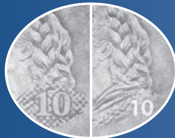
Multitonal watermark with SIGNUM™ /with electrotype